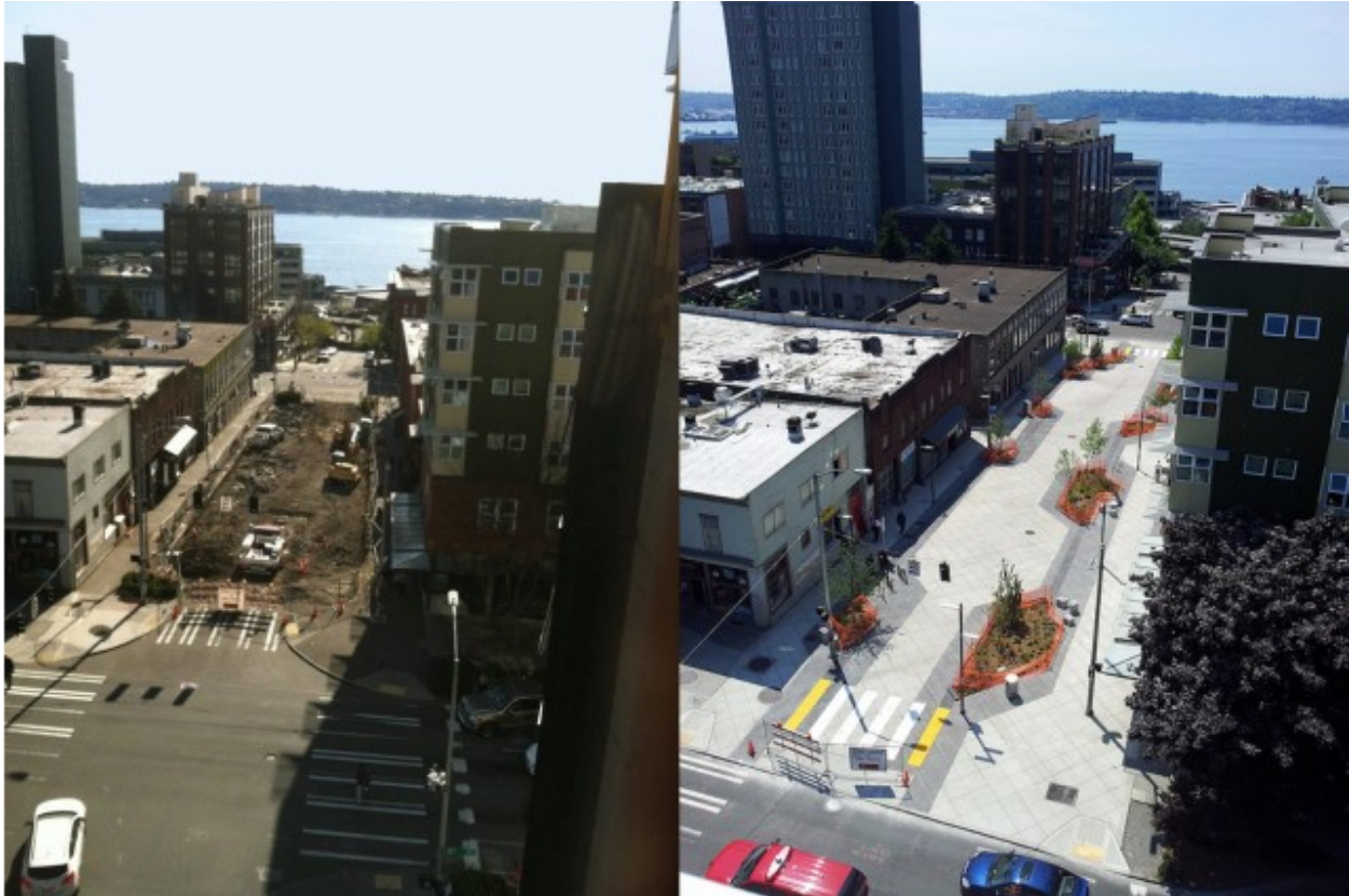
Bell Street, during and shortly after construction.

Additionally, the City of Los Angeles' Great Streets initiative has adopted multiple aspects of shared streets into its renovations of major thoroughfares, seeing both fiscal and popular success. One of the most prominent examples of this has been the Venice Boulevard Great Streets project. In 2016, the city refurbished a 0.8 mile stretch of Venice in Mar Vista with bollard-protected bike lanes, restored and decorated sidewalks, commissioned murals, and parklets on the sidewalks and in medians.